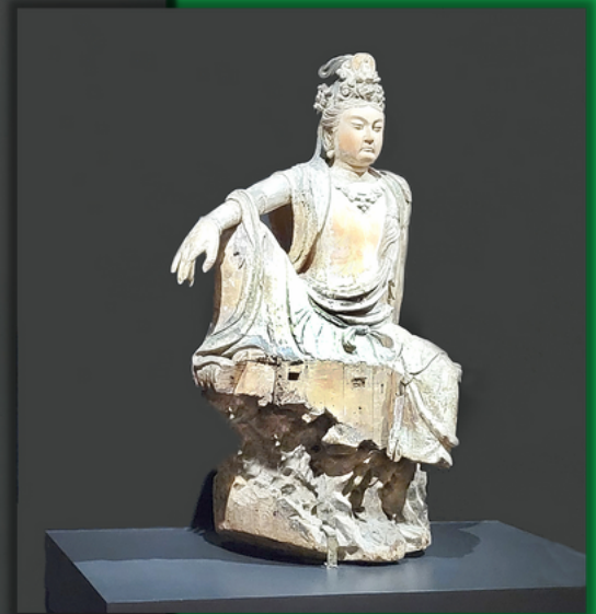
Bodhisattva Guanyin of the Southern Seas Wood Sculpture, 13th Century, China